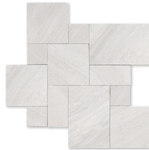
TL18887 S.O* skyline vein cut textura versailles pattern 1 1/4" 8.00 sqft/pcs