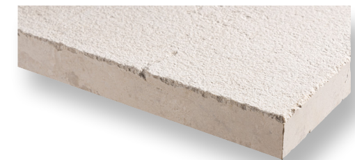
textura bevelled edge - honed finish - sandblasting with granules

*(S.O.) : Special Order. Lead times may vary 8-10 weeks depending on product.