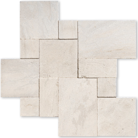
TL18885 S.O* diana royal textura versailles pattern 1 1/4" 8.00 sqft/pcs