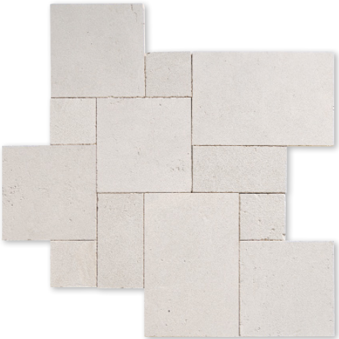
TL18886 S.O* cappuccino textura versailles pattern 1 1/4" 8.00 sqft/pcs