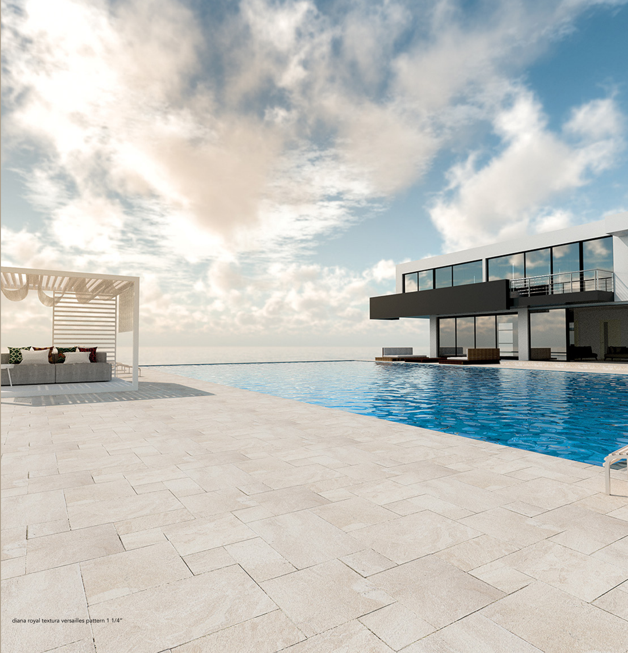
diana royal textura versailles pattern 1 1/4"