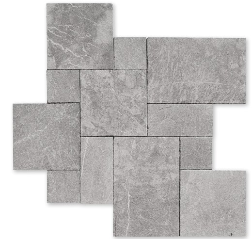
TL18888 S.O* iris black textura versailles pattern 1 1/4" 8.00 sqft/pcs