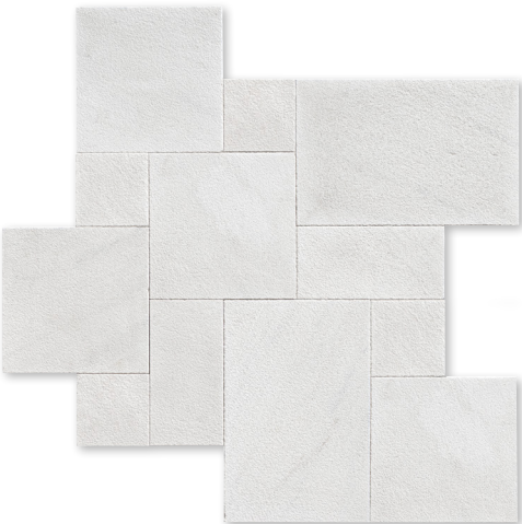
TL18890 S.O* fantasy white textura versailles pattern 1 1/4" 8.00 sqft/pcs