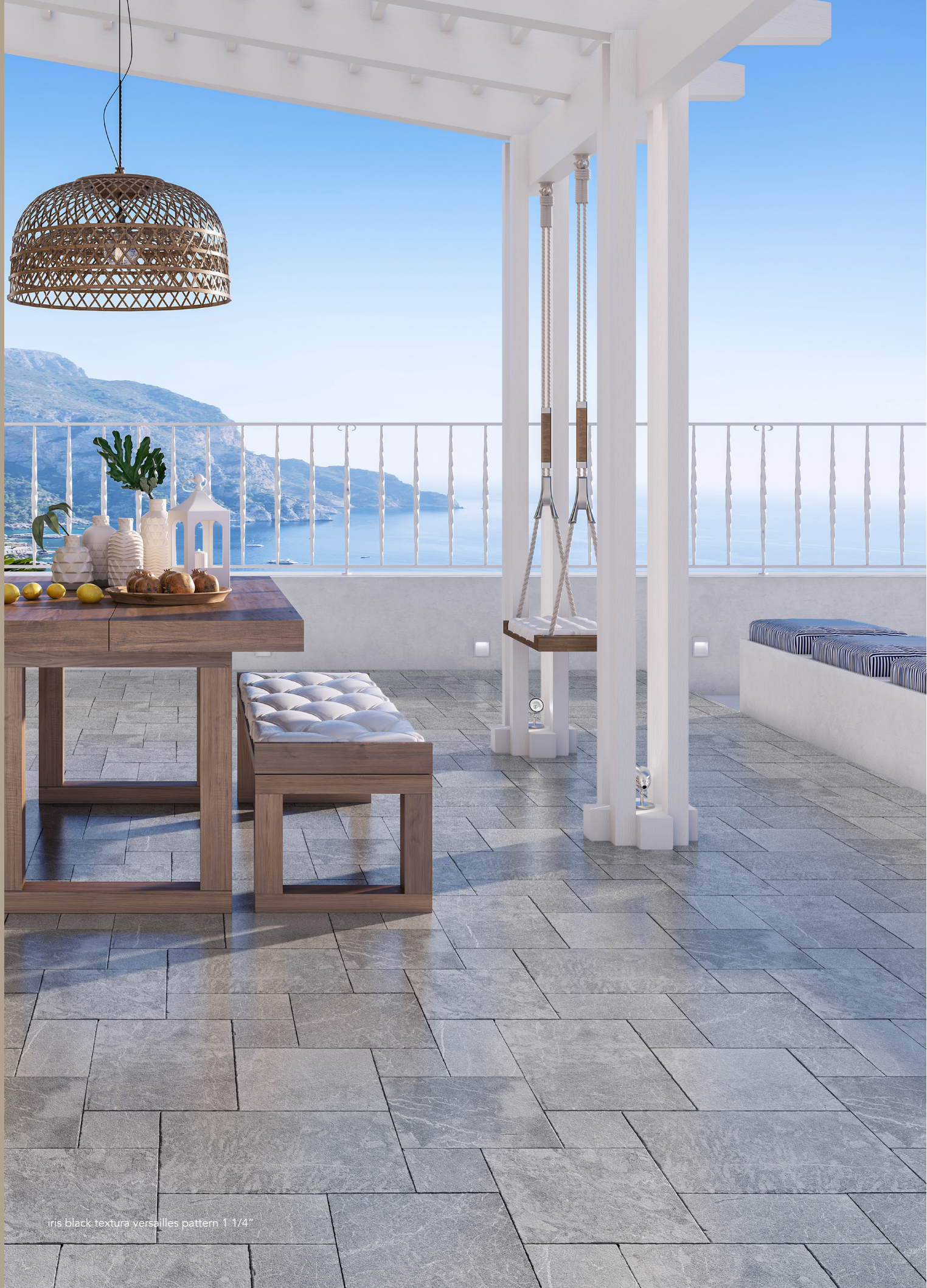
iris black textura versailles pattern 1 1/4"