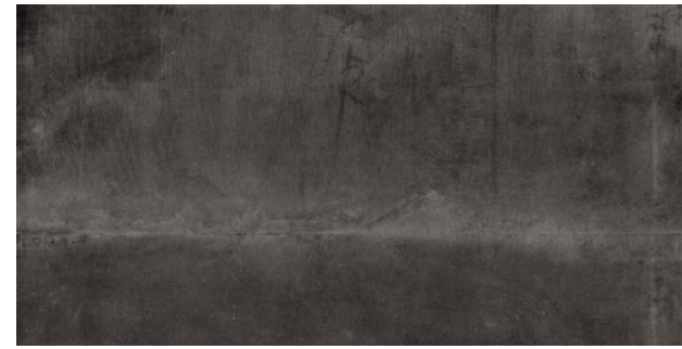
WIS13157 reside black honed 12"x24"x5/16" in stock