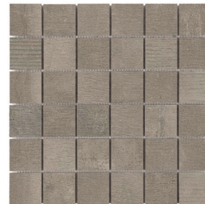
WIS13175 reside brown honed straight joint 2"x2" 12"x12" in stock