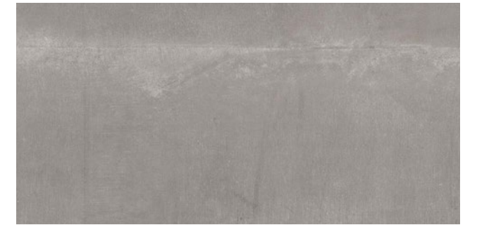
WIS13147 reside ash honed 24"x48"x5/16" in stock