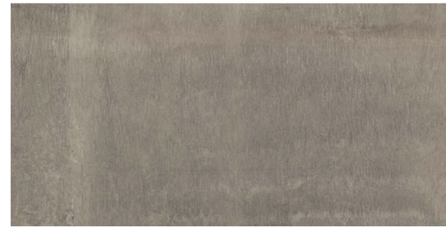
WIS13154 reside brown R11 textured 24X48X5/16 in stock