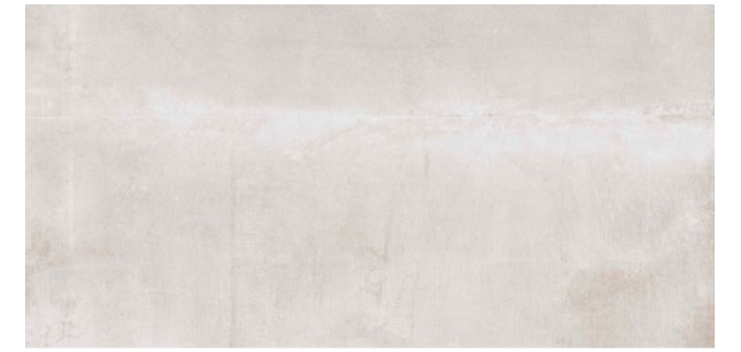
WIS13148 reside beige honed 24"x48"x5/16" in stock