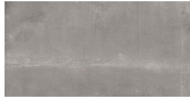
WIS13155 reside ash honed 12"x24"x5/16" in stock