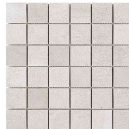
WIS13176 reside beige honed straight joint 2"x2" 12"x12" in stock