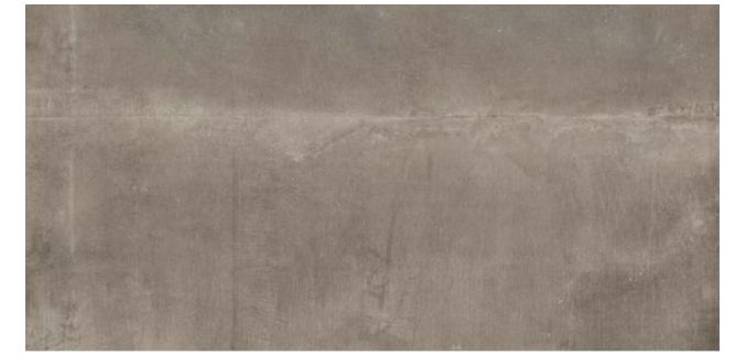
WIS13150 reside brown honed 24"x48"x5/16" in stock