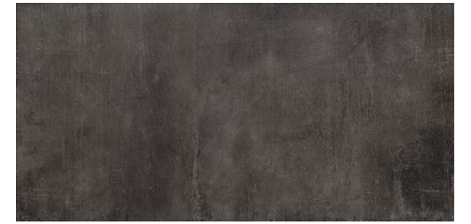
WIS13149 reside black honed 24"x48"x5/16" in stock