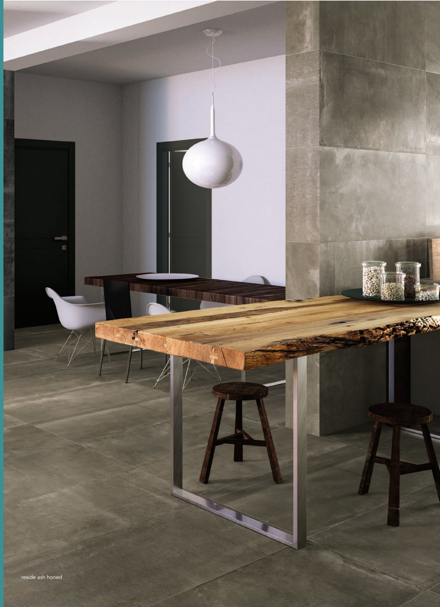
reside ash honed