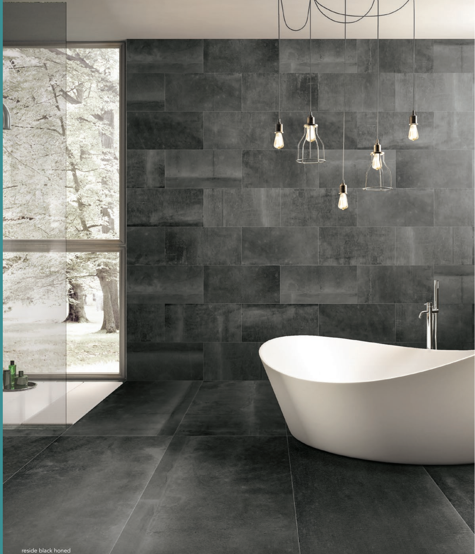
reside black honed