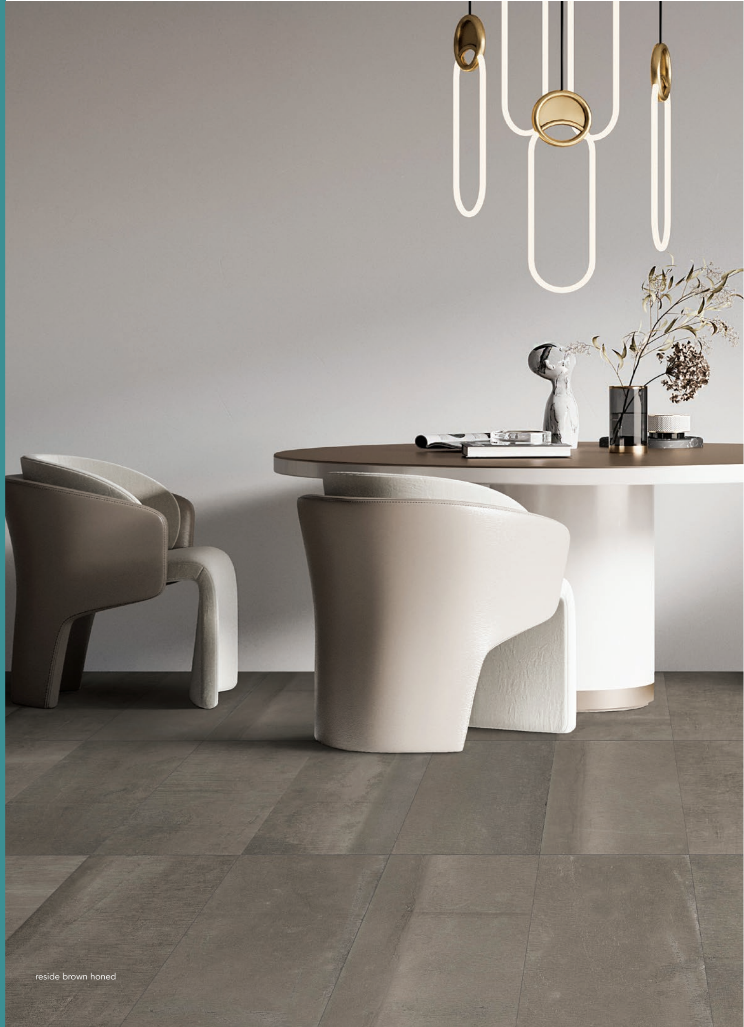
reside brown honed