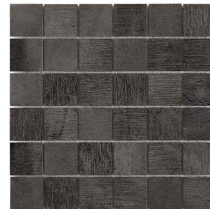
WIS13177 reside black honed straight joint 2"x2" 12"x12" in stock