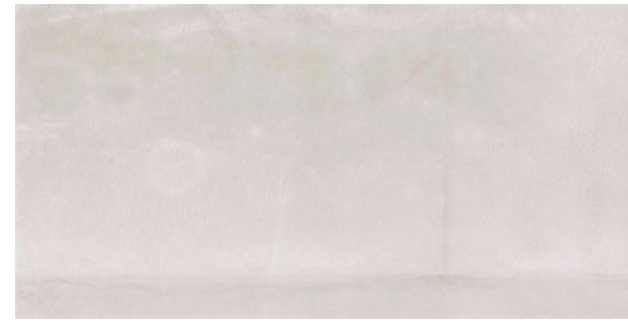
WIS13156 reside beige honed 12"x24"x5/16" in stock