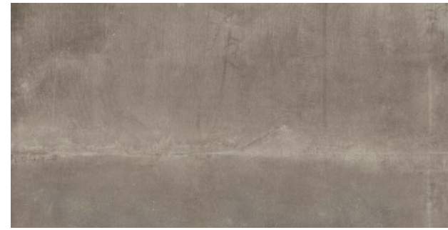
WIS13158 reside brown honed 12"x24"x5/16" in stock