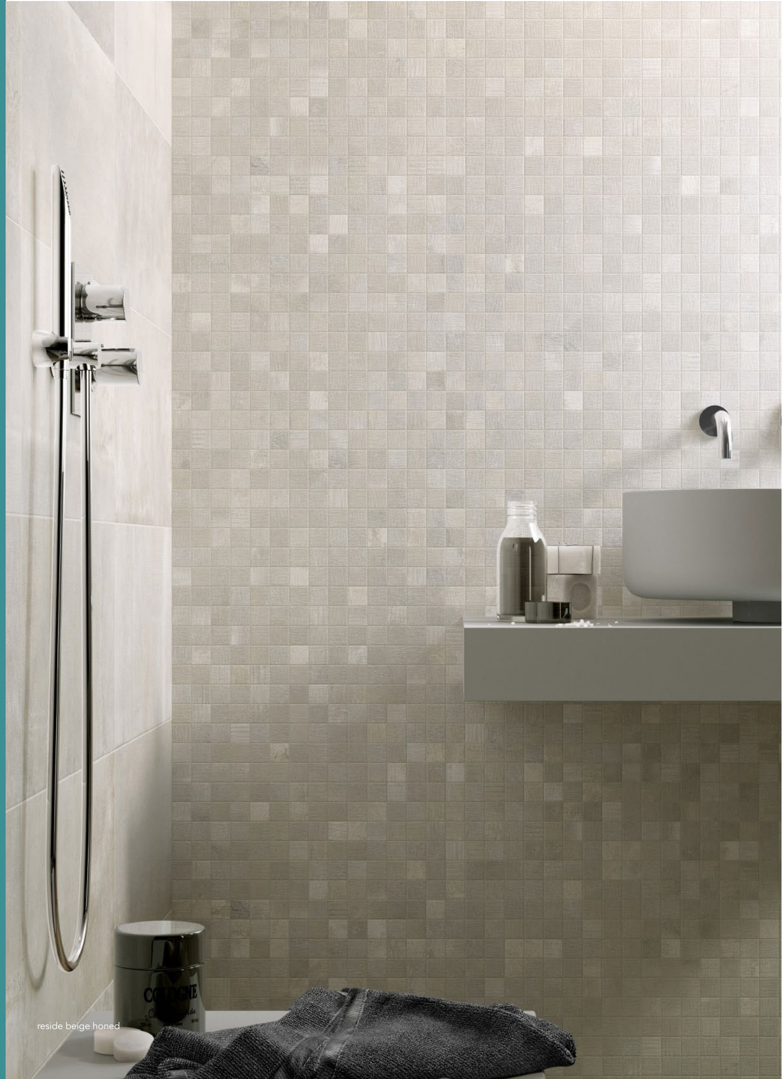
reside beige honed