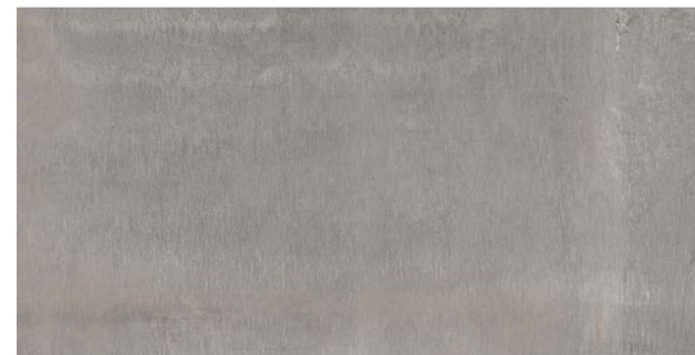
WIS13151 reside ash R11 textured 24X48X5/16 in stock