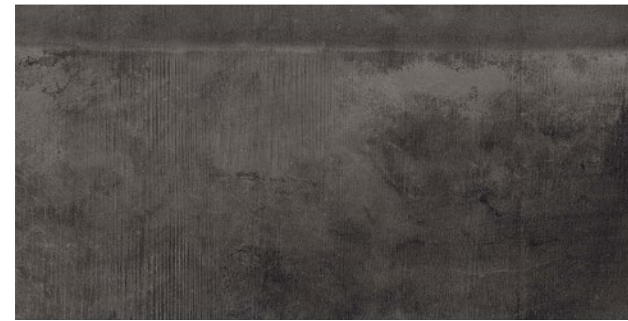
WIS13153 reside black R11 textured 24X48X5/16 in stock