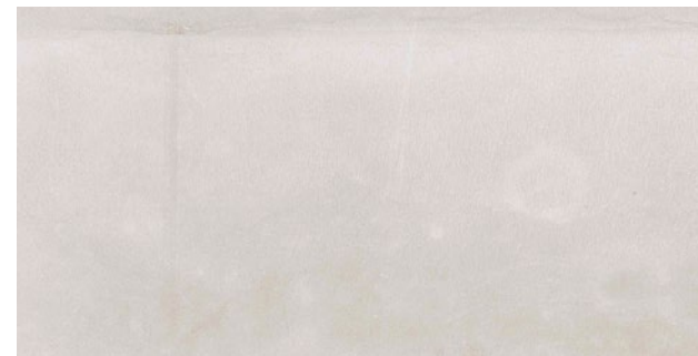
WIS13152 reside beige R11 textured 24X48X5/16 in stock