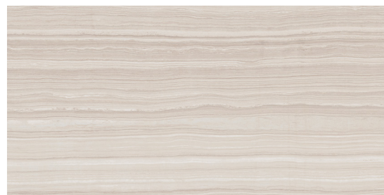
WIS11867 classic tan honed 12"x24" in stock