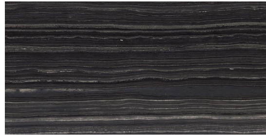
WIS11869 universe honed 12"x24" in stock