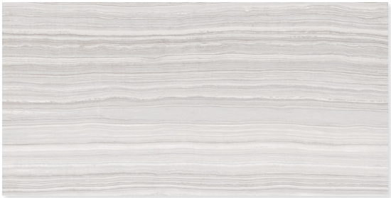
WIS11865 azul honed 12"x24" in stock