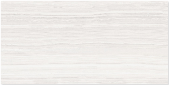
WIS11866 bright honed 12"x24" in stock