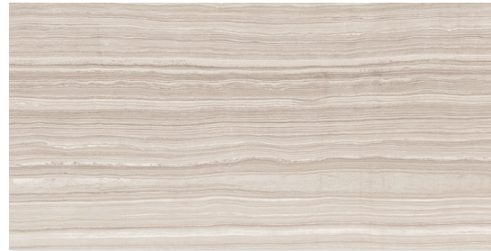
WIS11868 taupe blend honed 12"x24" in stock