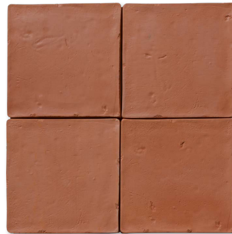
TL80739 handmade terra cotta 6"x6"x3/8" 0.25 ft2/pc