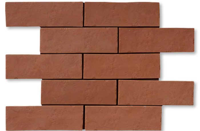
TL80738 handmade terra cotta 2"x8"x3/8" 0.11 ft2/pc