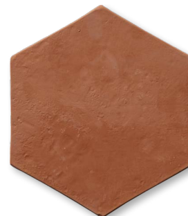
DC00427 handmade terra cotta hexagon 8" 0.37 ft2/pc