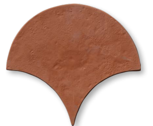
DC00428 handmade terra cotta fan 8" 0.22 ft2/pc