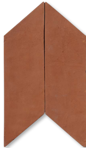
DC00431 handmade terra cotta chevron 3"x7 11/64"x3/8" 0.15 ft2/pc