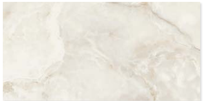
WIS12564 carrara onyx grey polished rectified 12"x24" - in stock WIS12558 carrara onyx grey polished rectified 24"x48" - *(S.O.) WIS12568 carrara onyx grey polished rectified 4"x12" - *(S.O.) WIS12548 carrara onyx grey honed rectified 12"x24" - *(S.O.) WIS12543 carrara onyx grey honed rectified 24"x48" - *(S.O.) WIS12553 carrara onyx grey honed rectified 4"x12" - *(S.O.)