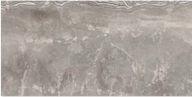
WIS12565 romano greige polished rectified 12"x24" - in stock WIS12560 romano greige polished rectified 24"x48" - *(S.O.) WIS12570 romano greige polished rectified 4"x12" - *(S.O.) WIS12550 romano greige honed rectified 12"x24" - *(S.O.) WIS12545 romano greige honed rectified 24"x48" - *(S.O.) WIS12555 romano greige honed rectified 4"x12" - *(S.O.)