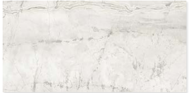
WIS12566 romano white polished rectified 12"x24" - in stock WIS12561 romano white polished rectified 24"x48" - *(S.O.) WIS12571 romano white polished rectified 4"x12" - *(S.O.) WIS12551 romano white honed rectified 12"x24" - *(S.O.) WIS12546 romano white honed rectified 24"x48" - *(S.O.) WIS12556 romano white honed rectified 4"x12" - *(S.O.)