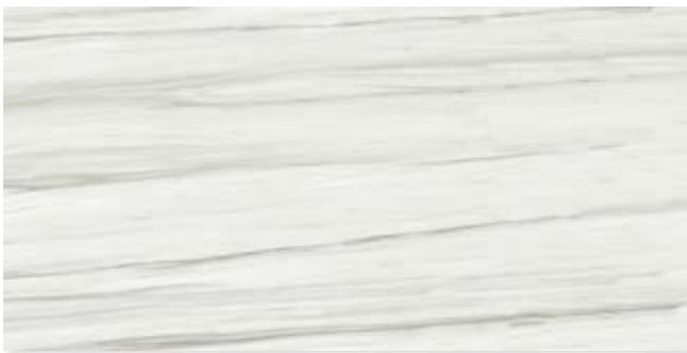
WIS12562 carrara zebrino polished rectified 12"x24" - in stock WIS12559 carrara zebrino polished rectified 24"x48" - *(S.O.) WIS12569 carrara zebrino polished rectified 4"x12" - *(S.O.) WIS12549 carrara zebrino honed rectified 12"x24" - *(S.O.) WIS12544 carrara zebrino honed rectified 24"x48" - *(S.O.) WIS12554 carrara zebrino honed rectified 4"x12" - *(S.O.)

*(S.O.) : Special Order. Lead times may vary 1 weeks depending on product.