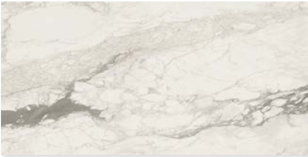
WIS12563 calacatta renoire polished rectified 12"x24" - in stock WIS12557 calacatta renoire polished rectified 24"x48" - *(S.O.) WIS12567 calacatta renoire polished rectified 4"x12" - *(S.O.) WIS12547 calacatta renoire honed rectified 12"x24" - *(S.O.) WIS12542 calacatta renoire honed rectified 24"x48" - *(S.O.) WIS12552 calacatta renoire honed rectified 4"x12" - *(S.O.)