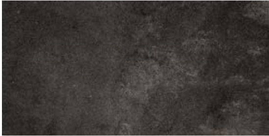
WIS11841 weathered black honed 12"x24" in stock