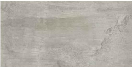
WIS11840 sage honed 12"x24" in stock