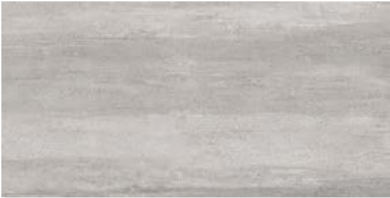
WIS11838 aqua honed 12"x24" in stock