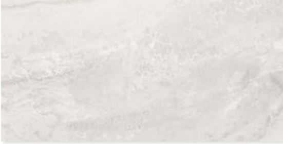
WIS11839 melted ice honed 12"x24" in stock