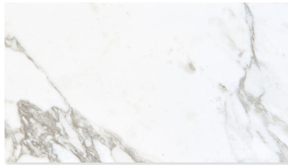
WIS11960 carrara arabescato rectified & polished 12"x24" in stock