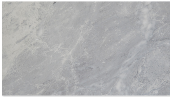
WIS11961 carrara blu rectified & polished 12"x24" in stock