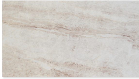
WIS11962 carrara paonazzo rectified & polished 12"x24" in stock