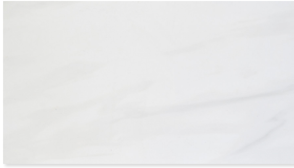
WIS11963 carrara venato rectified & polished 12"x24" in stock

More sizes or finishes may be available through special order. Please contact your sales representative for more details.