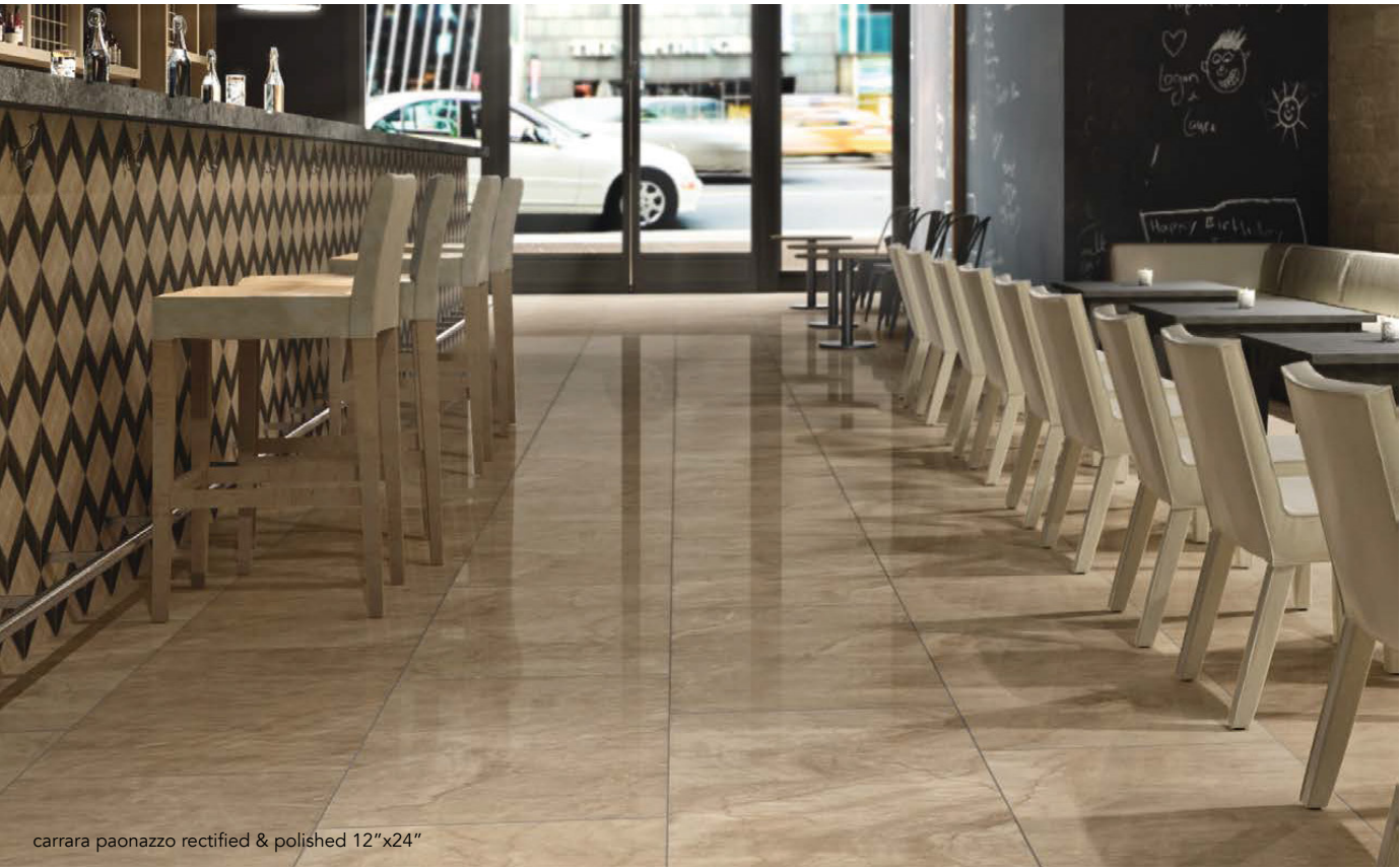
carrara paonazzo rectified & polished 12"x24"