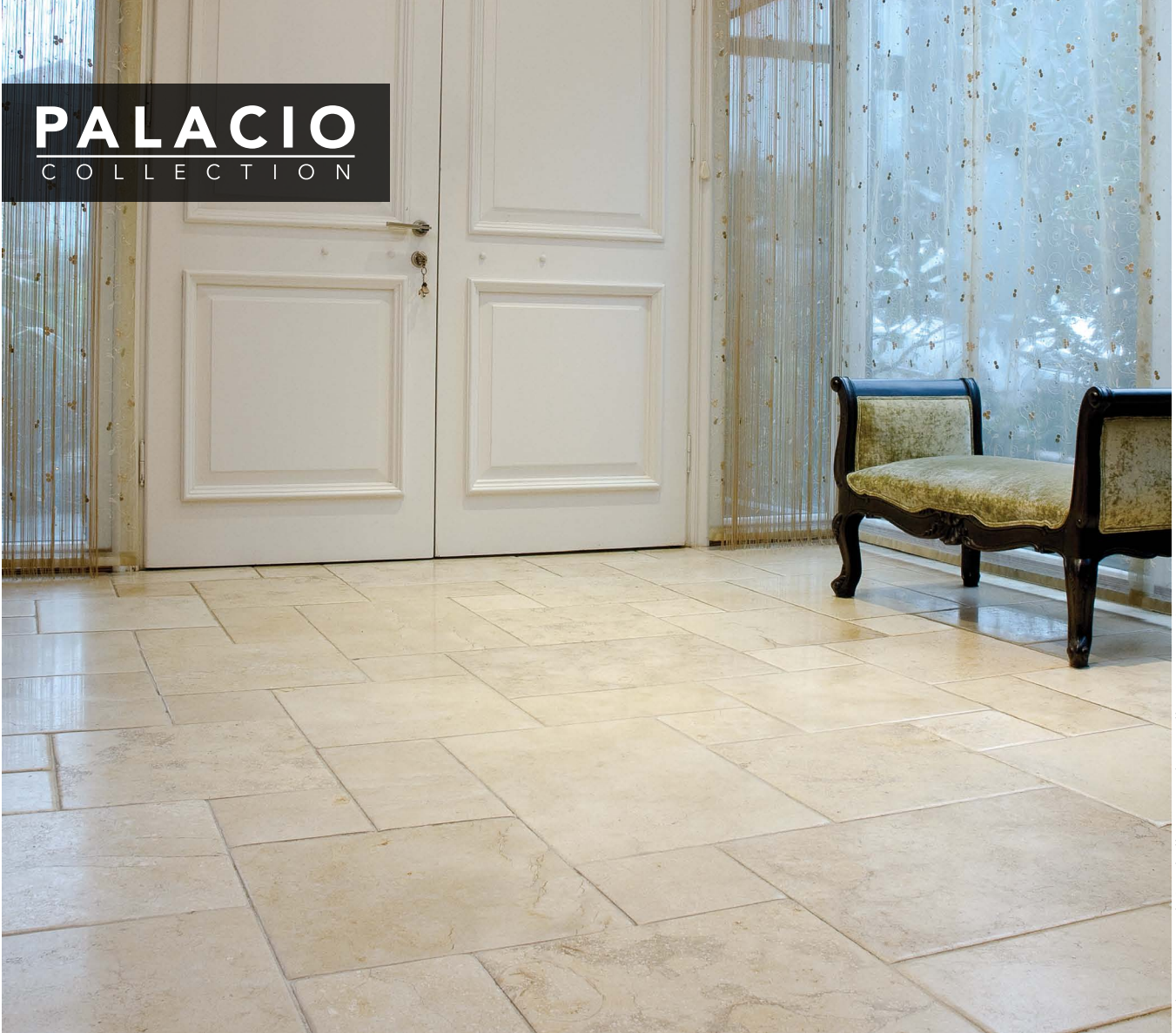
Product Featured: Seashell Antiqued Versailles Pattern 1/2"