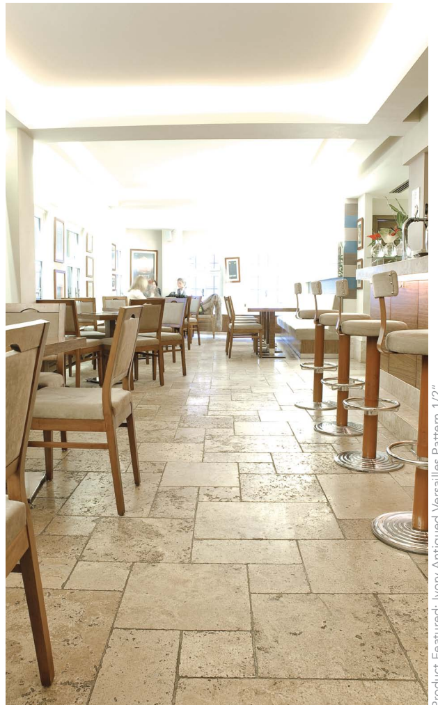
Product Featured: Ivory Antiqued Versailles Pattern 1/2"