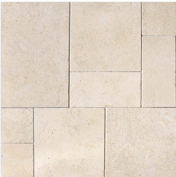
Seashell Antiqued Limestone TL12627 - Versailles Pattern 1/2"