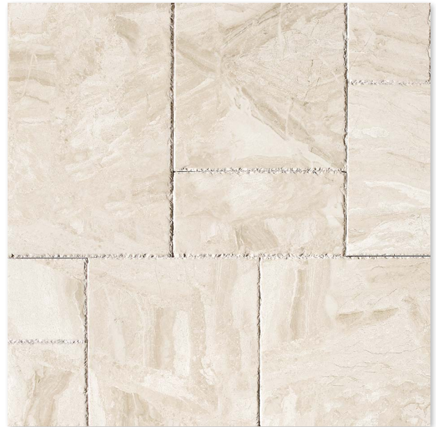
Diana Royal Brushed & Chiselled Marble TL14295 - Versailles Pattern 1/2"