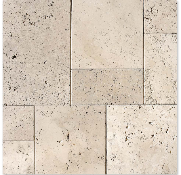
Ivory Antiqued Travertine TL12199 - Versailles Pattern 1/2"