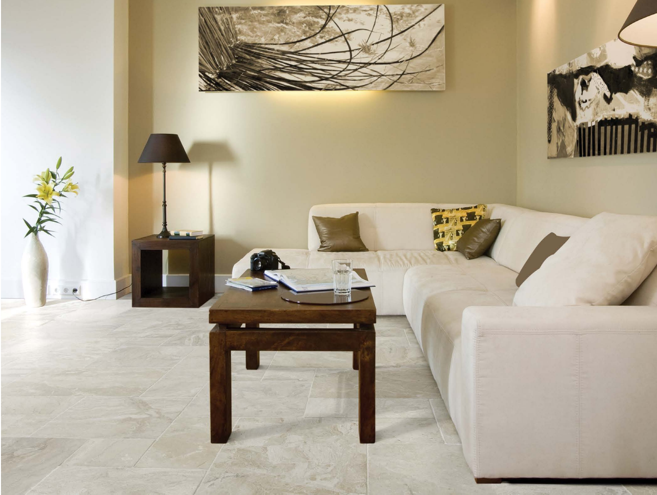
Product Featured: Diana Royal Tumbled Versailles Pattern 1/2"