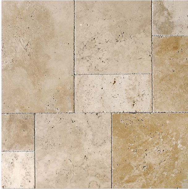
Classic Pave Real Travertine TL13440 - Versailles Pattern 1/2"