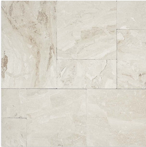
Diana Royal Tumbled Marble TL14091 - Versailles Pattern 1/2"