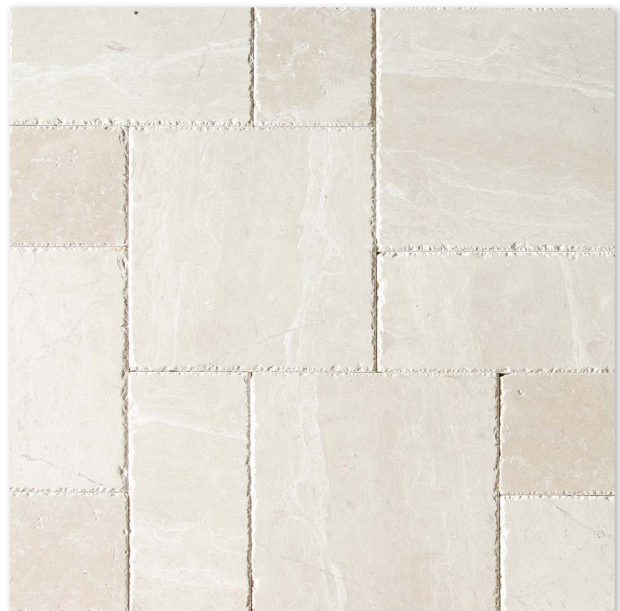
Royal Cream Brushed & Chiselled Marble TL16390 - Versailles Pattern 1/2"