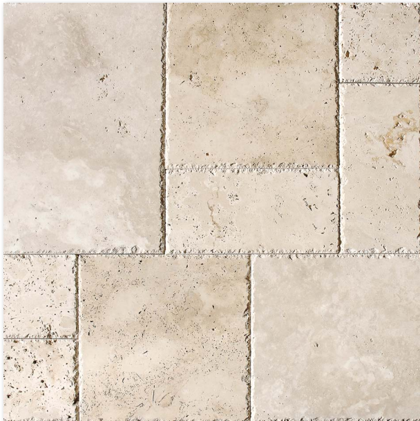
Ivory Unfilled & Chiselled Travertine TL12631 - Versailles Pattern 1/2"